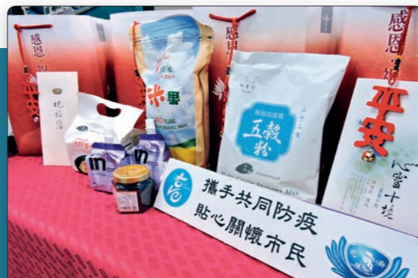
From February 25 to April 17 alone, Tzu Chi donated 41,900 gift packs to 13 city and county governments in Taiwan for distribution to people under home quarantine. The gift packs included items such as multi-grain powder, instant rice, noodles, black tea, and a consolation letter from Master Cheng Yen.