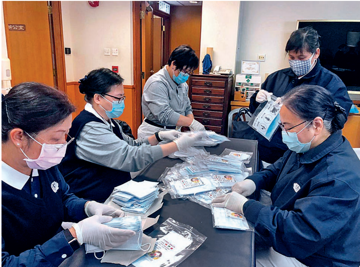
Tzu Chi volunteers in Hong Kong package face masks to be distributed to the underprivileged.