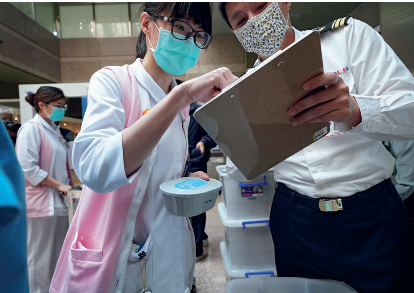
Tzu Chi meals delivered to Tri-Service General Hospital are distributed to hospital workers.