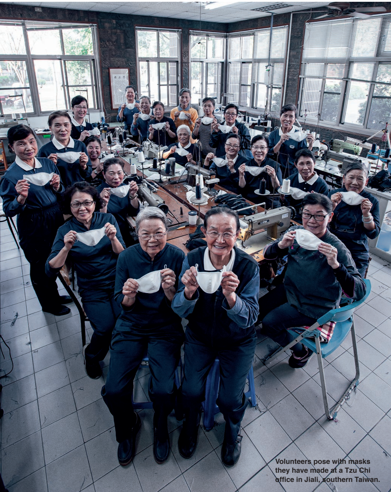
Volunteers pose with masks they have made at a Tzu Chi office in Jiali, southern Taiwan.

in the fight against the pandemic. Though it is not hard to make a mask, she emphasized the importance of being mindful in the process, especially when it comes to teaching other volunteers how to make one. If she makes a mistake in how she teaches others, her error could be multiplied many times over.