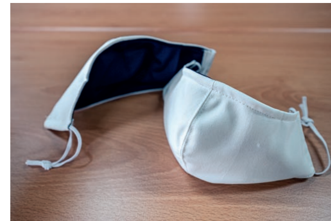
Cloth masks made by Tzu Chi volunteers. These masks were made with moisture-resistant fabrics provided by DA.AI Technology.