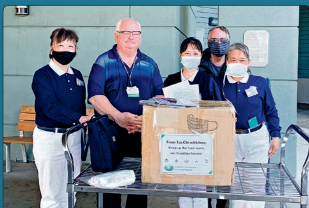
Tzu Chi volunteers in Las Vegas, the United States, donated 1,000 surgical masks to Summerlin Hospital Medical Center on April 15.